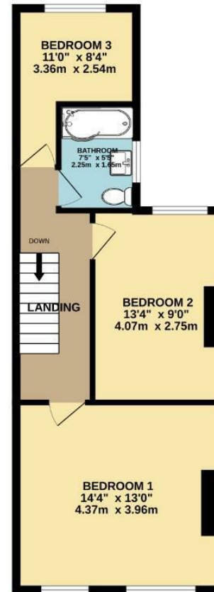
1ST FLOOR 495 sq.ft. (46.0 sq.m.) approx.